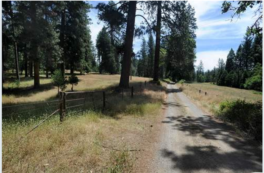
Undeveloped land and the road into Campstool Ranch in Rail Road Flat on June 14.