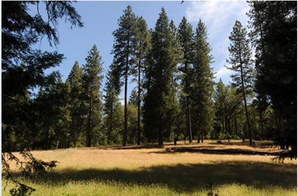
Undeveloped land at Campstool Ranch in Rail Road Flat on June 14.

Contact reporter Dana M. Nichols at (209) 607-1361 or dnichols@recordnet.com . Visit his blog at recordnet.com/calaverasblog .