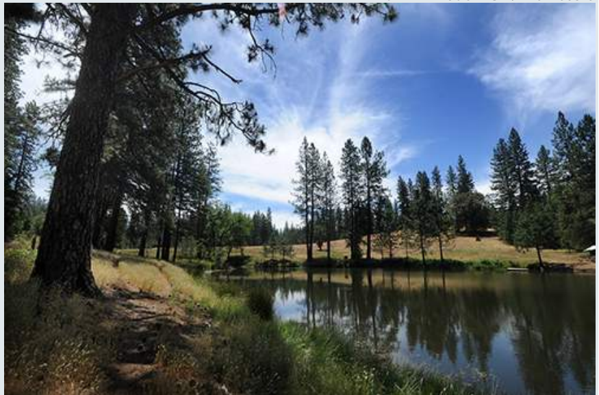
Undeveloped land and the pond at Campstool Ranch in Rail Road Flat on June 14.